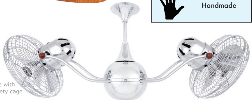
shown in Polished Chrome with metal blades and safety cage

The Vent-Bettina rotational fan is thoughtfully designed with its arms gently upward curving. The fan offers fluid lines and quiet axial rotation with motor heads which can be infinitely positioned in 180-degree arcs for optimum air movement; the greater the angles of the motors to the horizontal support rods (up or down), the faster the axial rotation. A slow, controlled axial rotation is achieved by both fan head position and fan blade speed.