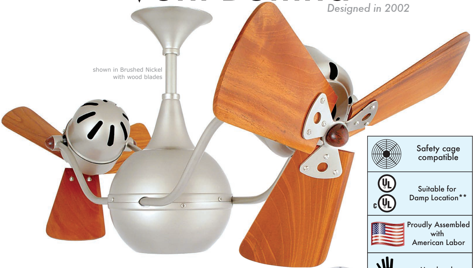
shown in Brushed Nickel with wood blades